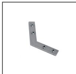
CONNECTOR ZM-NA-120 C28242N00 Ref. arch 42729