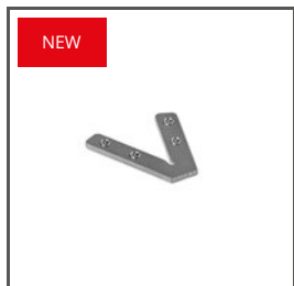
CONNECTOR ZM-45 C28070N00 Ref. arch 40688