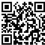
Smartphone app control (WL-Box1 video)